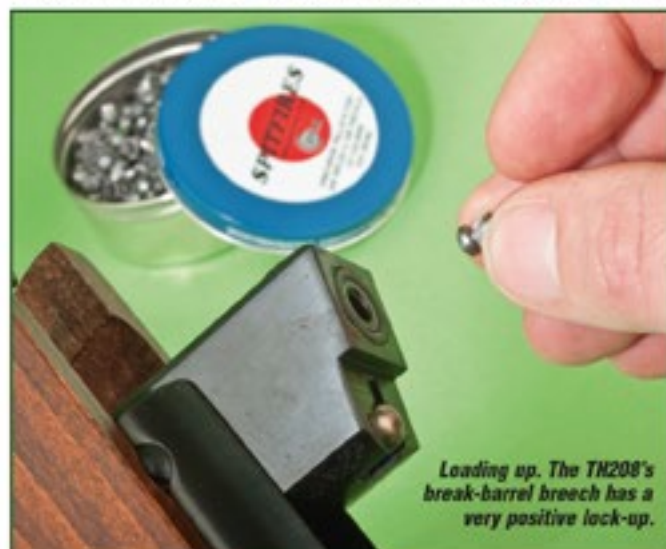
Loading up. The TH208's break-barrel breech has a very positive lock-up.

The rifle has an automatic safety catch which pops out at the end of the receiver when you cock the rifle; an 'S' (for Safe) is visible when it's on. Its design is such that it's easy to push off, and just as easy to re-set if you wish –