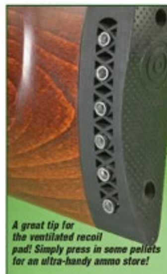
A great tip for the ventilated recoil pad! Simply press in some pellets for an ultra-handly ammo store!