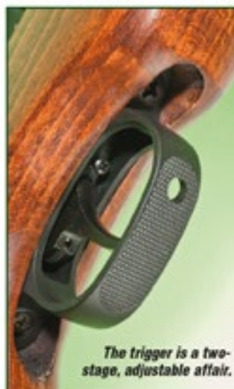
The trigger is a two-stage, adjustable affair.