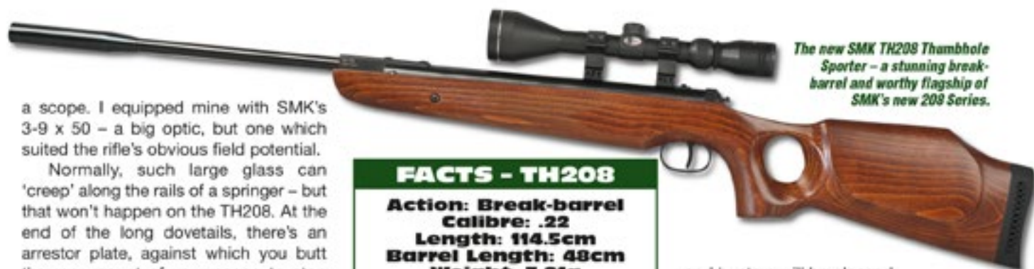
The new SMK TH208 Thumbhole Sporter – a stunning break-barrel and worthy flagship of SMK's new 208 Series.

a scope. I equipped mine with SMK's 3-9 x 50 – a big optic, but one which suited the rifle's obvious field potential.