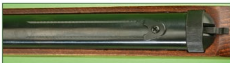
Above: The TH208's receiver is grooved for a telly and features an arrestor plate at the end.

On paper, the TH208/3-9 x 50 combo was pretty devastating, with sub-inch groups easily 'do-able' out to 30 yards – but the rifle didn't need ring targets to prove its worth in the field.